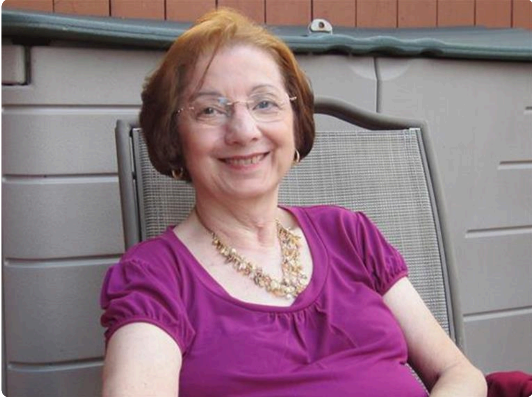
Taken at Thanksgiving 2011 at Mar's and Lee's on the patio. A wonderful day for all.